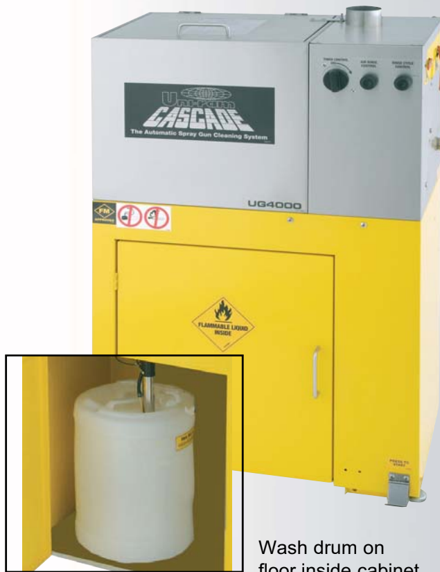
Wash drum on floor inside cabinet

See each model for Distinctive Manual Cleaning