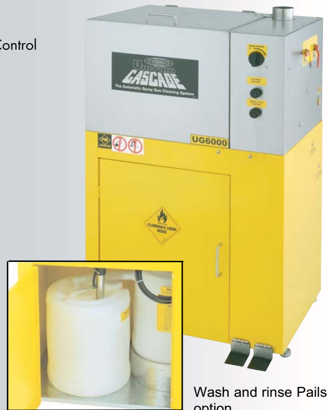
Wash and rinse Pails option